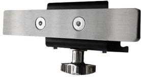
Modular Side Rails