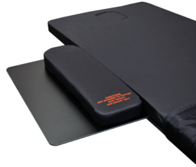
Rectangular Arm Board