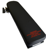
Surgical Arm Boards *Require siderails