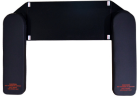
Procedural Arm Boards